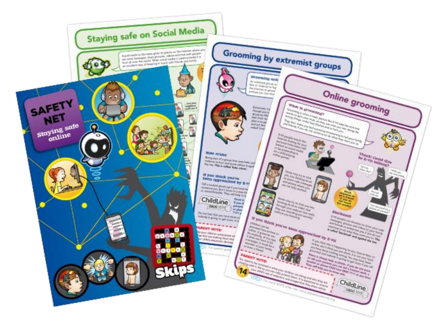
Educational resources from Skips Safety Net

For more information on Skips Safety Net, you can watch this short informational video.