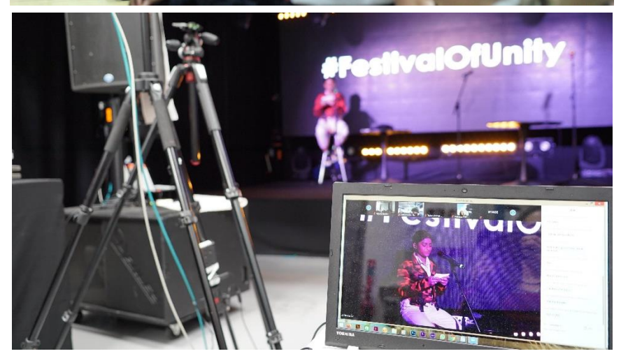
Stills from Odd Arts' 'Festival of Unity'