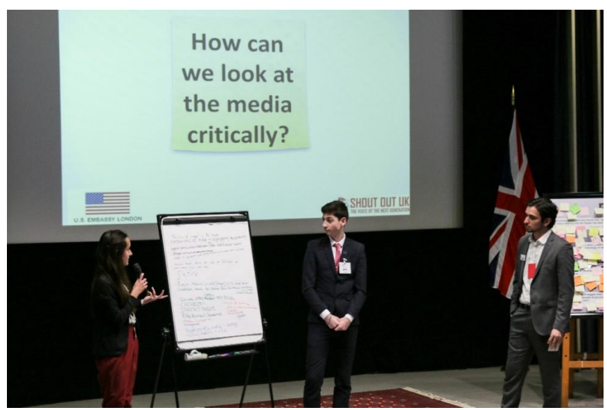
Students engaging in a session on media literacy with Shout Out UK

The full report for this project can be read <u>here</u>, and you can read more about Shout Out UK's work with Prevent <u>here</u>.